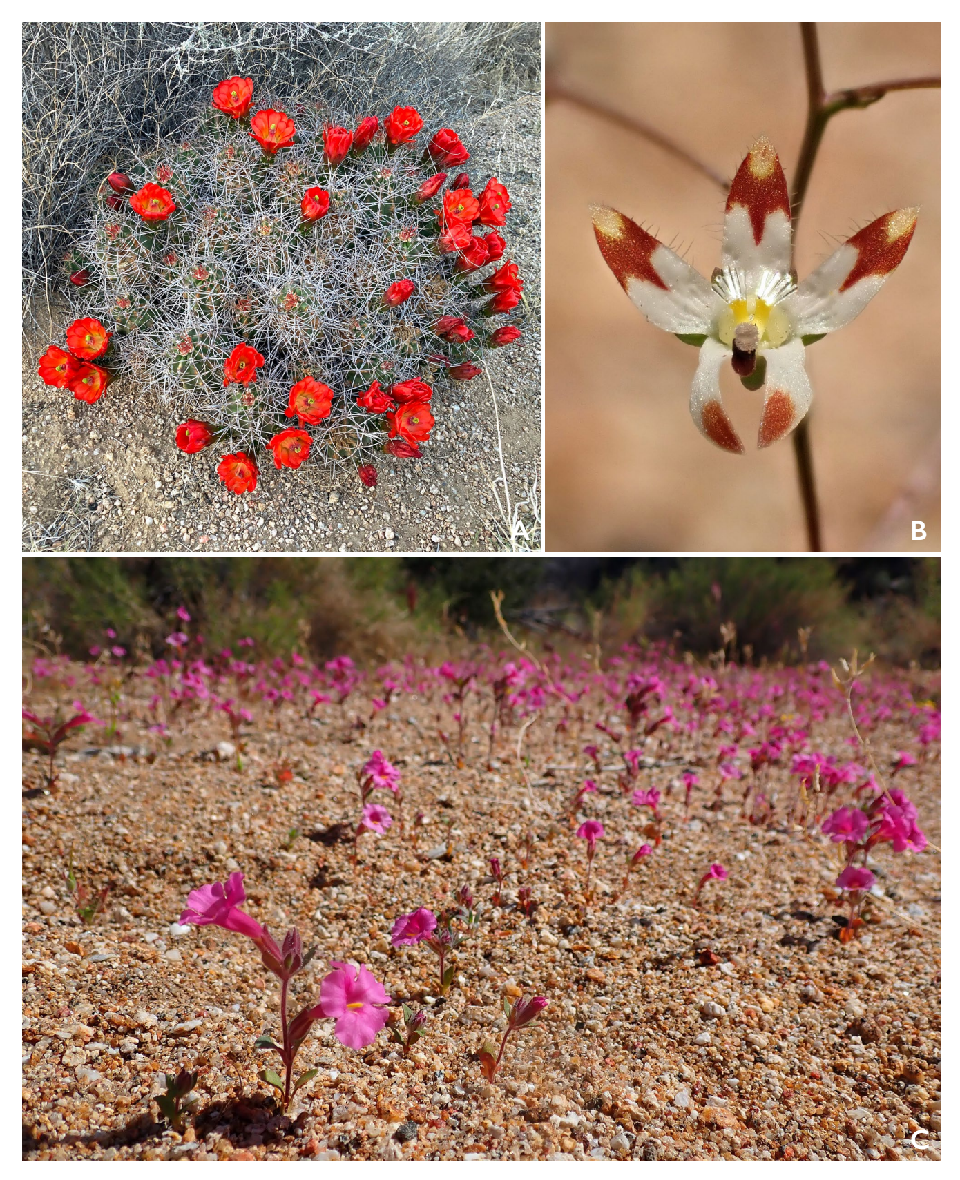
Figure 5. Desert rarities other than comps. A. Mojave Kingcup cactus ( Echinocereus triglochidiatus ssp. mojavensis ). B. Nemacladus rubescens Greene (Campanulaceae) is a tiny desert wildflower that contains shiny crystal-like structures that presumably serve to attract curious pollinators to these otherwise invisible little plants.. C. Bigelow's monkeyflower ( Diplacus bieglovii (A.Gray) G.L.Nesom; (Phrymaceae).