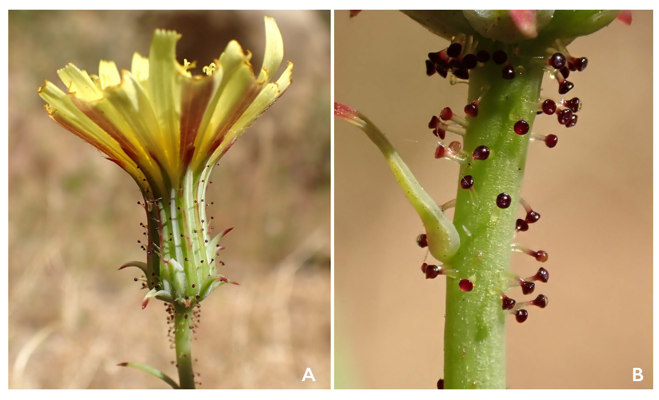
Figure 6. Yellow tack-stem ( Calycoseris parryi A. Gray; Cichorieae) grows in low gravelly areas. A. Lateral view of the head. B. Close up of the conspicuously dotted stem with tack-shaped glandular trichomes.