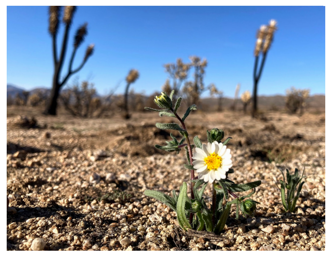
Figure 4. Dome fire in Mojave National Preserve was a catastrophe, burning over a million Joshua Trees ( Yucca schidigera Ortgies, Asparagaceae) in a site deemed refuge for these plants under increasing climate change. In the scar of the burn during a spring without rain, we were surprised to find dense blooms of annual plants, including Layia glandulosa Hook. & Arn., among the charred remains of the woodland.

total rain, and we had good luck in collecting plants from the rocky hillsides of the Coast and Transverse ranges. There, L. glandulosa shows its greatest amount of variability in flower color, including individuals with yellow, white, cream, or even pink to deep rose ray corollas. These trips were not without mishaps of their own, though, including runins with disgruntled property owners, belligerent authorities, and smelly hitchhiking Pacific Crest Trail hikers. Two large rattlesnakes made appearances on our field trips, startling us but inflicting no harm. On one trip, the back of a pickup truck was left open by mistake and all of the plant presses and camping gear ended up spread across the highway! Thanks to a quick search party response and some local desert dwelling do-gooders, everything was recovered intact. We were surprised by our success