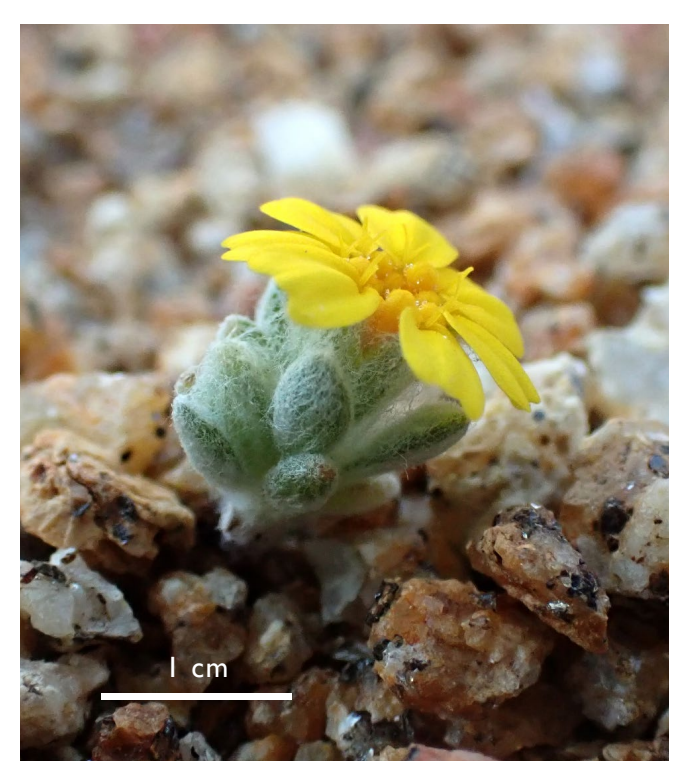
Figure 3. The often tufted, diminuitive annual Wallace's woolly daisy ( Eriophyllum wallacei A. Gray) grows ephemerally in decomposed substrates and can be one of the few plants to bloom in a dry year.

It was hard, hot, and uncomfortable field work, but there were redeeming moments as well. In the Peninsular Ranges of southern California, where only paltry Layia glandulosa could be found, some uncommon desert rarities were doing surprisingly well. These included flowering beavertail cacti