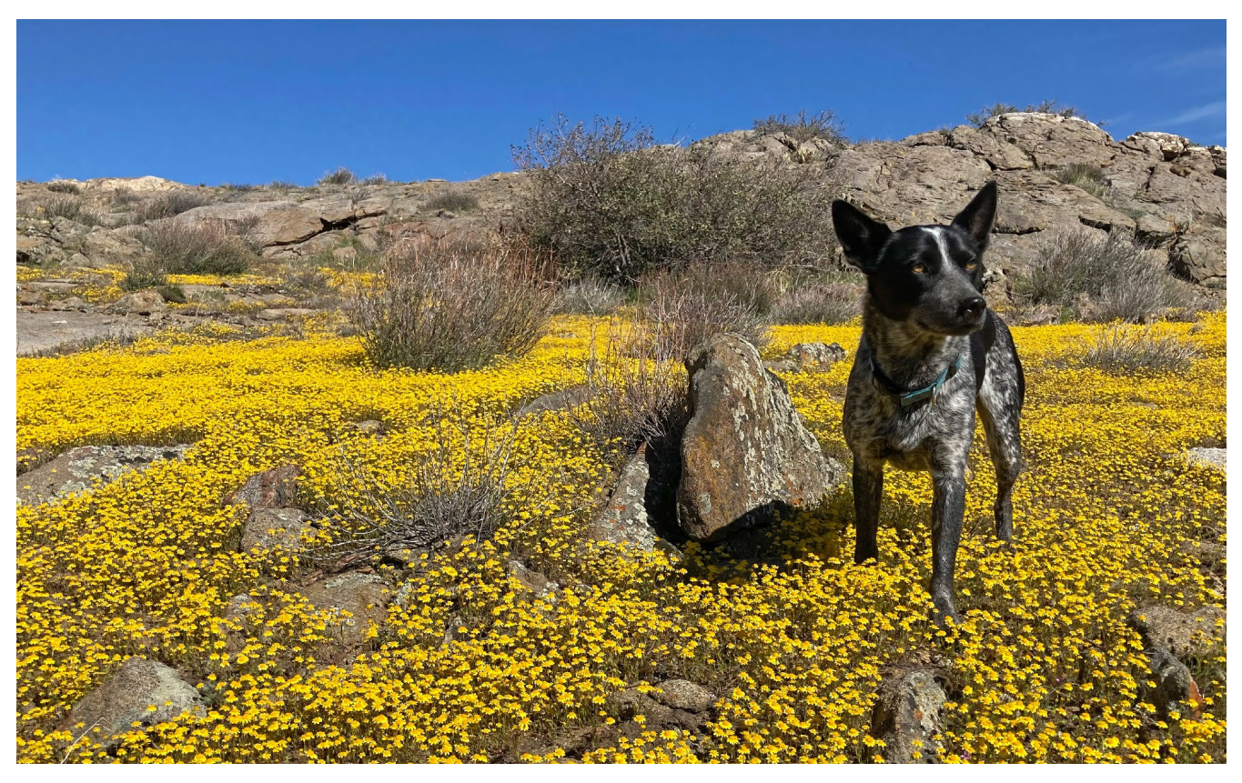
Figure 8. A key member of the collecting team, Rio, helped sniff out rare blooms in a drought year, such as this carpet of goldfields ( Lasthenia gracilis (DC.) Greene) in the peninsular mountain ranges.

were out of luck, but when we walked the trail, to our surprise, there were flowers everywhere! Apparently, the heat and release of nutrients from the wildfire had stimulated a good wildflower bloom despite the complete lack of water (Figure 4). This was unheard of, since the convergence of drought and wildfire in the desert was such an exceedingly rare occurrence. It was even hard for us to believe. In the middle of a dry, drought-stricken desert with no germination for hundreds of miles we had found an abundance of wildflowers in the charred, blackened scar of a Joshua tree woodland! We found maps of the recent wildfires and burn scars turned out to be productive places to find L. glandulosa in other parts of the state, as well, helping us to finally fill out the remainder of gaps in our sampling up to 100 populations.