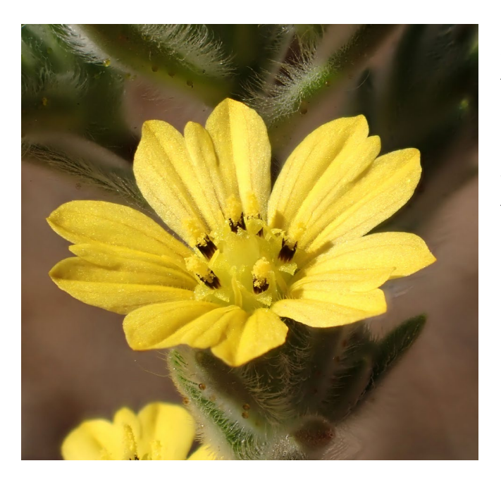
Figure 7. The hare-leaf ( Lagophylla ramosissima Nutt.) is a selfcompatible annual tarweed (Madieae) with soft-hairy leaves, fan shaped rays, and yellow to golden brown glands that are attractive to look at but occasionally cause dermatitis on contact.

early on in finding plants, by May we (Figure 9) had found about 70 populations of L. glandulosa despite the unprecedented drought, but the most difficult part of the species range lay ahead, the Mojave Desert.