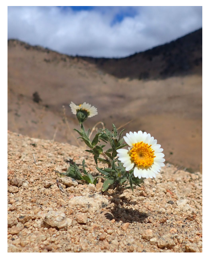
Figure 2. The jewel of California compositae Layia glandulosa Hook. & Arn. grows in gravelly or sandy soils where it is an abundant part of ephemeral spring wildflower blooms. The spicy-scented glandular foliage, often dark purple tinted stems, heterogamous heads, and linear, long tapering awl-shaped disk pappus with woolly tufted bases set this species apart from other annual members of the Madieae Jeps. The ray florets can be white, yellow, cream, or lilac-tinged (or lacking in the derivative species L. discoidea D.D. Keck)

public, both to minimize potential damage from past fires and to prevent new ones from starting. Field work was looking like a harder prospect than we expected.